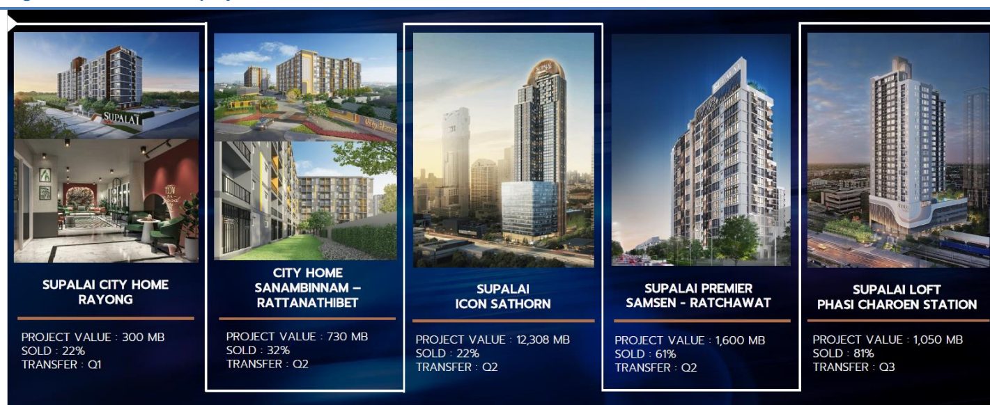
Figure 2: Condominium projects to be transferred in FY24